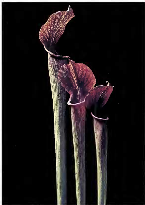
Figure 3: Sarracenia 'Lamentations'.